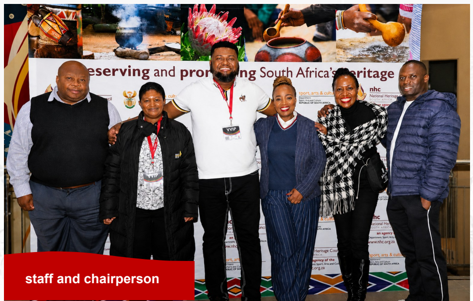
staff and chairperson

One learner reflected emotionally on the experience, saying, "Participating in Youth Camp 2026 was a life-changing experience for me. Listening to the stories of the 1976 Soweto Uprising survivors helped me understand the sacrifices young people made for the freedoms we enjoy today. Visiting heritage sites such as Constitutional Hill